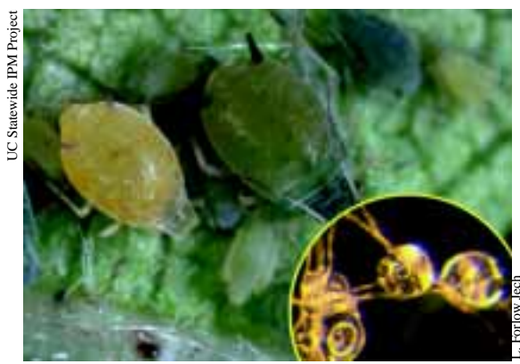
The cotton aphid, Aphis gossypii, excretes honeydew rich in melezitose (ca. 30–40%). Their droplets (inset, 50X) tend to be larger than those produced by whiteflies.

1997, CA cotton growers spent a statewide average of $7/A on whitefly control and $38/A on aphid control. Combined, these costs accounted for over half of their total insect control budget. In TX, aphid and plant sugars have been the largest sources of stickiness. TX cotton growers have spent up to $19/A (1995) on aphid control and $21/A (1991) on whitefly control. In addition to these immediate costs, excessive dependence on chemical control tactics carries with it increased frequency and risks of insecticide resistance with an incalculable cost to growers and the industry.