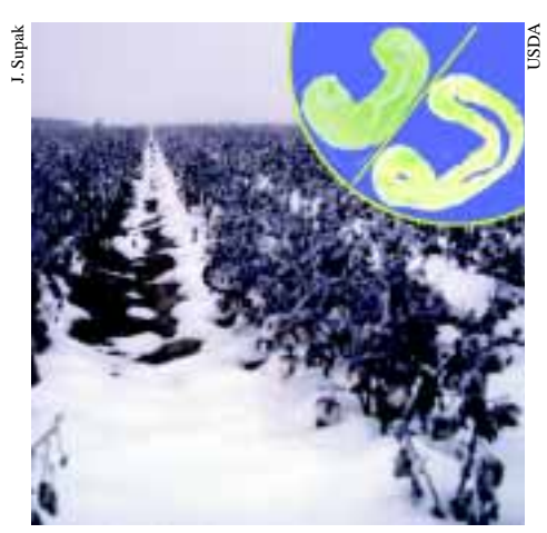
A preharvest freeze can set off a chain of events that leads to immature fibers and excessive plant sugars. Inset (250X) are cross sections of fibers, normal (left) & immature (right). Note wall thicknesses and lumen volume.

Sticky cotton can reduce cotton gin output (in bales/hr) by up to 25%. At the textile mill, excessive wear and increased maintenance of machinery may occur even with slightly sticky cotton. In severe instances mill shutdown with a thorough cleanup is required.